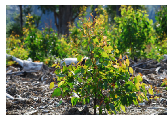
Eucalypt seedling growing vigorously in the prepared ash-bed after the regeneration burn.

These variable retention operations are challenging to plan and carry out. With further research we expect to increase both aggregated and dispersed retention harvest techniques in those areas of wood production forest where site conditions and worker safety concerns can be appropriately addressed.