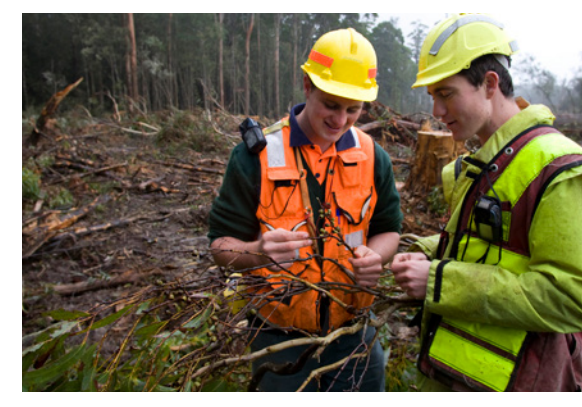
Forest officers performing a regeneration survey checking seedling stocking 12 months after sowing seeds.