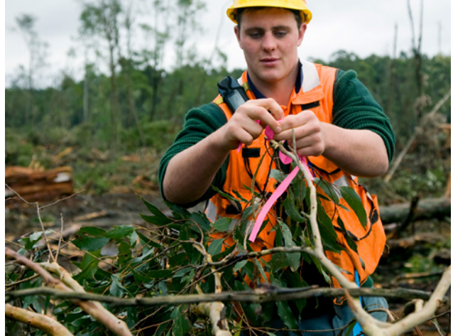
Forest worker marking eucalypt crown foliage containing seed (gum nuts) for contractors to collect prior to coupe debris being burnt.