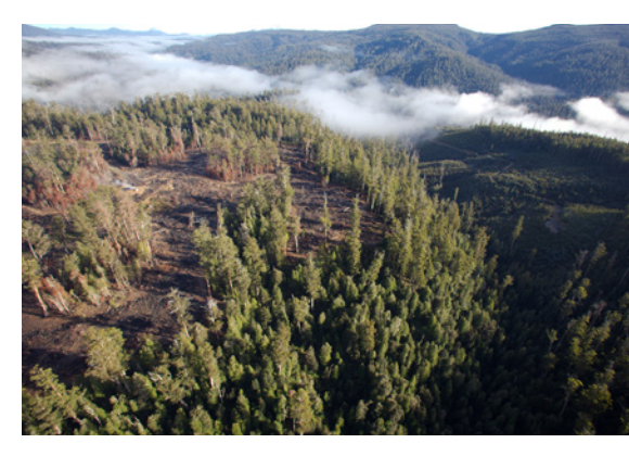
Variable retention coupe where part of the original forest is retained after harvesting.