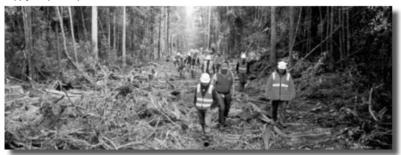
Figure 2. Primary snig tracks were cleared to a minimum width of about 9 m to allow an excavator to rotate at least 180 degrees. Slash was piled onto the cleared area to protect the soil and make a semi-permanent extraction path.

There would be five cutting cycles per century and the average stump return time for eucalypt and blackwood might be 100 years and up to 400 years for celery-top pine which has the slowest growth rate of the special species timbers.