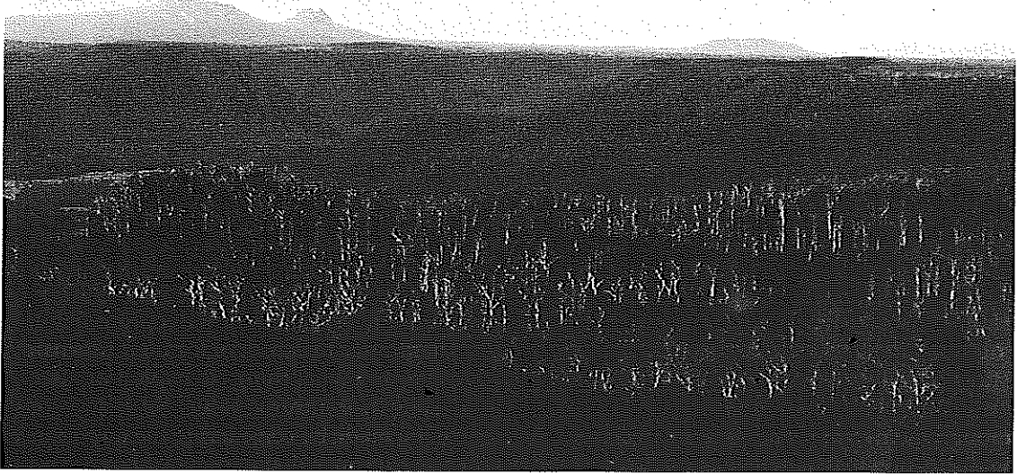
Photo 1. The planar surface of the north-eastern Tasmanian highlands plateau is a landscape surface which was originally eroded to its present planar form in pre-Permian times (c. 300 million years BP), was then buried by younger rocks, and has now been exhumed by geologically recent erosion. From a geoconservation perspective, it is significant as an extensive and well-expressed exhumed 'fossil' landscape surface. However, its significance resides in its large-scale form only, since no vulnerable small-scale pre-Permian features have been identified on the exhumed surface, and it is consequently robust to the effects of forestry operations.

culture and science contrasts with the utilitarian resource values derived from the removal, processing or manipulation of rocks or soils by means such as mining or agriculture. Examples of geoheritage include features significant for scientific research and education, the use of unaltered natural systems as baselines against which to monitor environmental changes elsewhere, landforms which contribute to the 'sense of place' of a community or which have played a significant role in the lifestyles of past cultures, and features which are valued for recreational, aesthetic and tourism purposes.