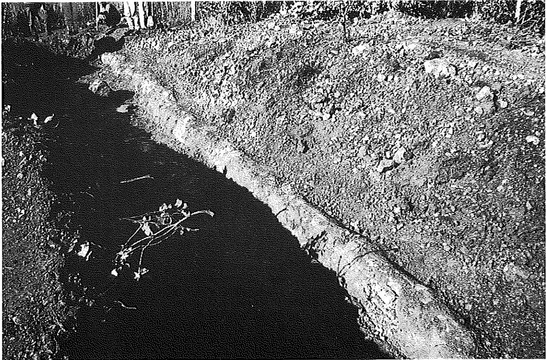
Photo 3. This 17-metre long fossil log of mid-Mesozoic age (possibly Jurassic, c. 170 million years BP) in State forest at Lune River is the largest fossil discovered in Tasmania to date. Its discovery highlights a classic dilemma in geoconservation: its existence only became known as a result of excavations associated with forestry activities, consequently its scientific significance was arguably enhanced by artificial exposure. However, the log is intensely fractured and suffered vandalism and theft whilst exposed. It proved necessary to re-bury the log in order to protect it from further damage pending a decision on its long-term management.

This said, the problem of actually deciding what is or is not significant can be a difficult